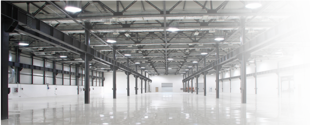
Application illustration only, subject lamps not used in photo.