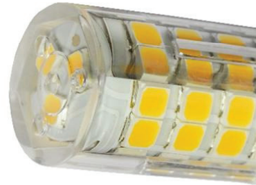
Top & Side Close-Up View